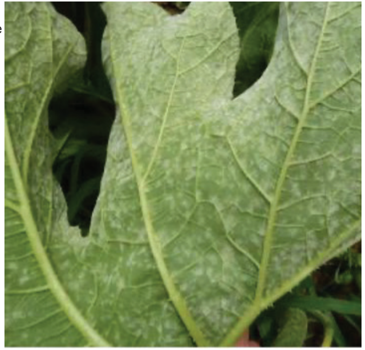
ucts are released. Cucurbit powdery mildew sporulation on a squash leaf.

ed. Cucurbit plants are susceptible to downy mildew from emergence; however, this disease usually does not start to develop until later in crop development when the pathogen is dispersed by wind into the region. The pathogen is thought to only be able to survive over winter in southern Florida, and from there spreads northward. There has been no evidence that the pathogen is surviving between growing seasons where winter temperatures kill cucurbit crops (outdoors above the 30th latitude). Tracking occurrences and paying attention to forecasted storms can alert you to when protectant and/or targeted sprays are warranted.