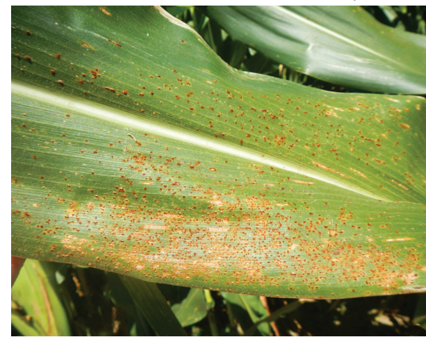
Figure 2. Southern rust on corn.

southern rust. The fungus that causes southern rust does not overwinter in Kentucky, but spores of the fungus move north on wind currents and weather each summer. To date, southern rust has been confirmed in Louisiana and Georgia. Southern rust typically arrives in Kentucky in mid-July, and whether a fungicide will be needed to manage southern rust at that time will depend on the crop growth stage at the time it is detected in an area. Fungicide applications may be needed to manage southern rust through the milk (R3) growth stage.