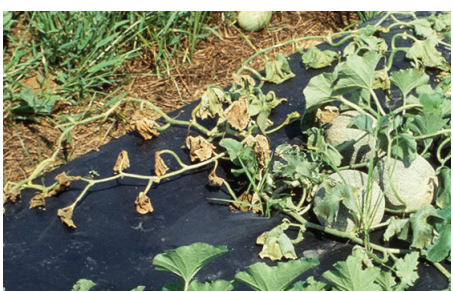
Figure 1: Infected plants eventually collapse with vines becoming brown and shriveled.