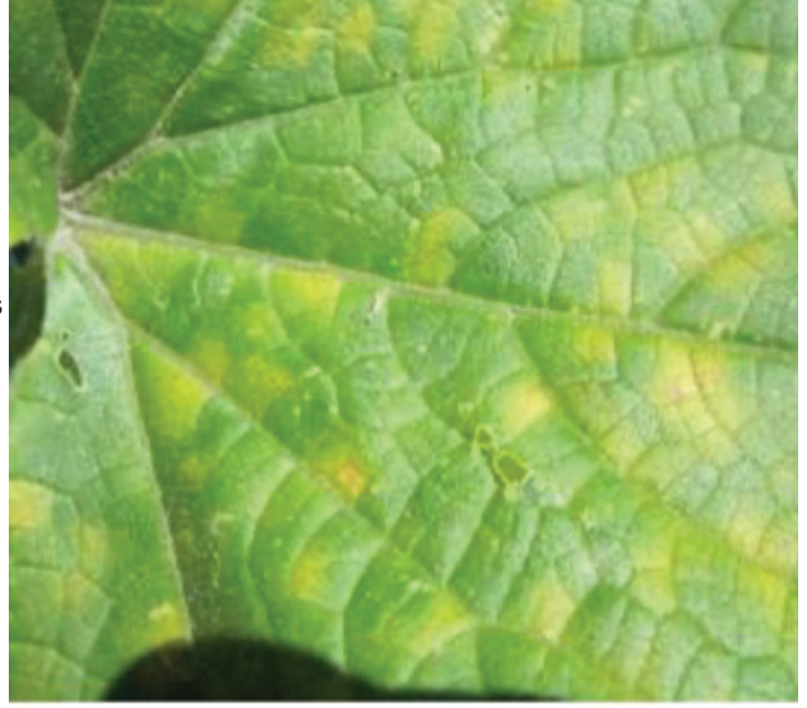
Symptoms of cucurbit downy mildew on the top side of a Quintec, Torino, cucumber leaf.

Presidio (43), Revus and Forum (40) are not recommended.