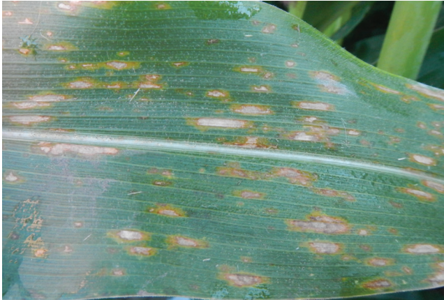
Fig. 1. Gray Leaf Spot